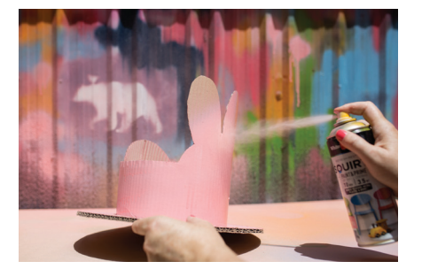
15 Shake your chosen colour of White Knight Squirts Spray Paint for 1 minute until you can hear the ball moving freely around the can.